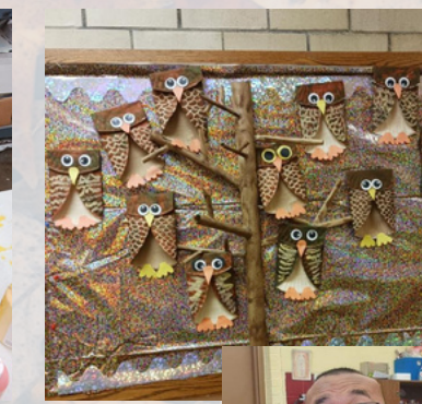
Trainees at our Oak Avenue location have been busy decorating the rooms and halls for fall!