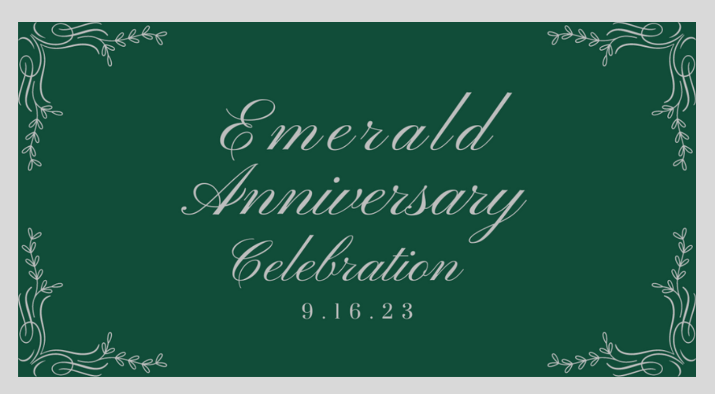
PWAC thanks everyone who attended or supported our 55th "Emerald" Anniversary Gala on Saturday, September 16 at the Meredith Inn in Kittanning!