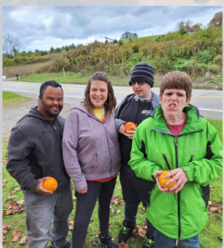
Clients at the AAC enjoyed picking out and decorating pumpkins!