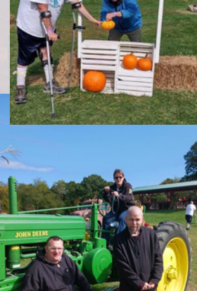
A few trainees enjoyed a trip to Renshaw Farms!